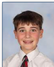
Charlie Buchan Middle School Vice Captain